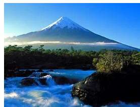
Osorno Volcano—Puerto Montt