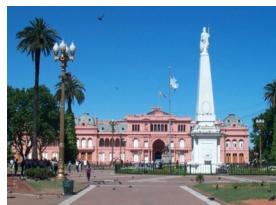
Buenos Aires—Casa Rosada